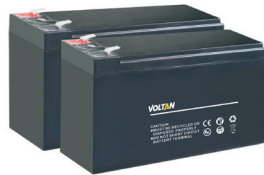
Optimized battery configuration 7AHh/9AH (12V)