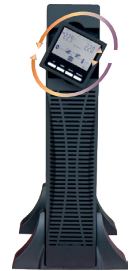
The LCD panel can be rotated